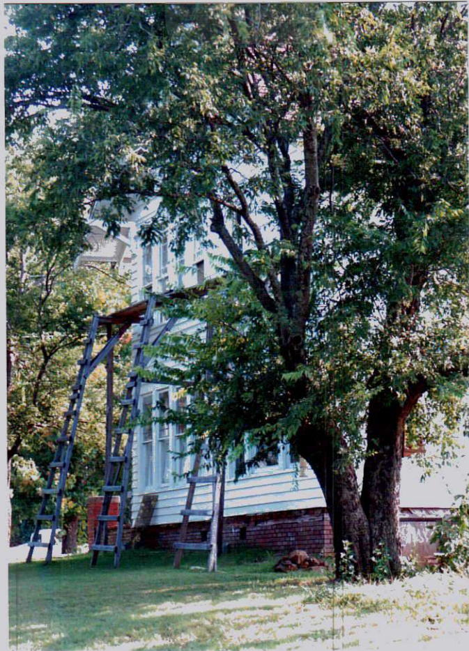
East side 1018 West Oak