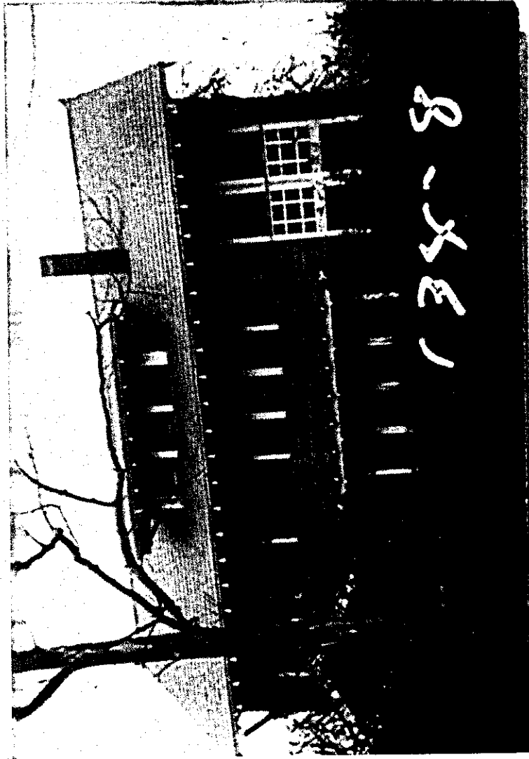
Photo of 1018 W. Oak taken in 1943 as part of the tax appraisal records