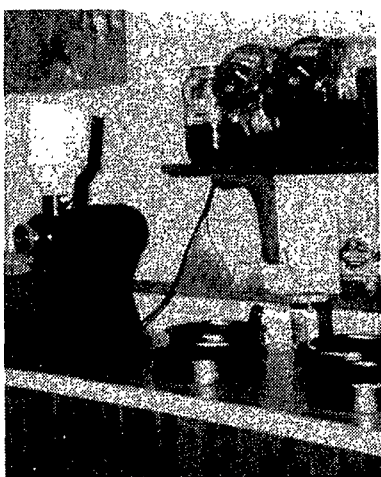
Bulk Nut Butters Honey & Soy Sauces

FRESH PRODUCE Nori's is one of the only sources of organic produce in the area. If you are concerned with the amount of pesticides and herbicides in your food, as well as the impact conventional agriculture has on the environment, eating organically grown produce is a viable alternative. A fresh produce delivery is made every Saturday. Most of the produce is organically grown. In the summer months, local produce is supplied. Fresh greens such as spinach, kale, collards and bro-