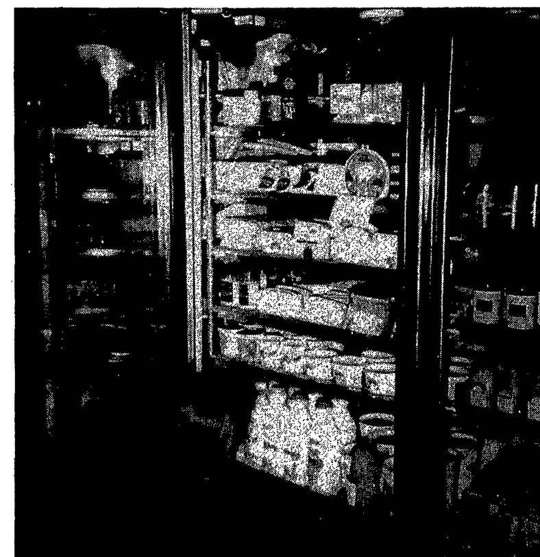
Lactose Free Milk-Dairy Free Cheese