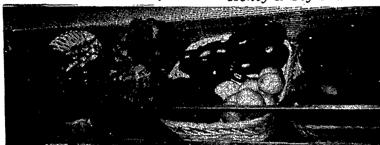
Fresh Organic Produce