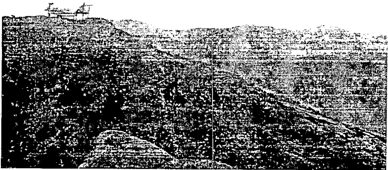
Fire Observation Tent on Pharaoh Mountain 1910

The state spent a total of $294.77 for the construction of the first observation station. (2), and built a three-mile telephone line to the summit to connect the station. This observation station also had an excellent radio relay link to areas unreachable by repeater towers.